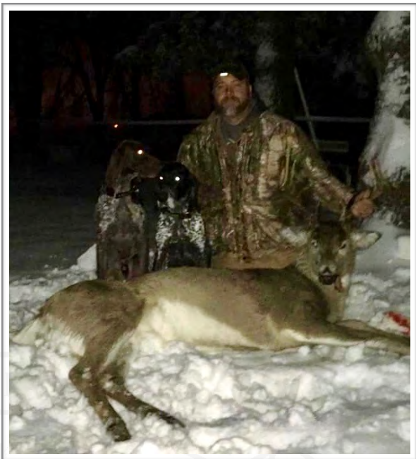
Alexis v Roche Jaune and Bazil v Golden Sun Blood tracking teamwork!